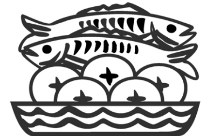
Loaves & Fishes